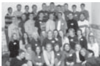
2002 Singles Conference

Volleyball Bowling Snow Tubing Mount Rushmore Crazy Horse Monument and much, much more!